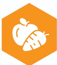
Nutrition and Diet Program