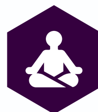
Yoga and Meditation Program