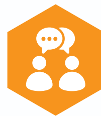
Wellness and Counseling Program