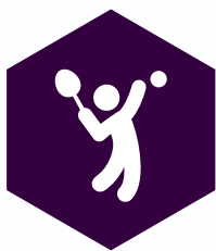
Physical Training and Sports

Wellness is an active process of becoming aware of and making choices toward a healthy and fulfilling life. Wellness is more than being free from illness. It is a dynamic process of change and growth. CMR Gandhi Public School believes in emotional, physical, social and intellectual wellness. In raising healthy children, it's not enough to just focus on the physical aspect of health. To be truly healthy, a child's emotional health must be nurtured and strengthened. Developing a mental attitude of wellness is also essential. Our goal is to have outstanding, vibrant health, not just to be free of disease. Children will learn that positive and healthy lifestyle choices lead to physical and mental wellness.